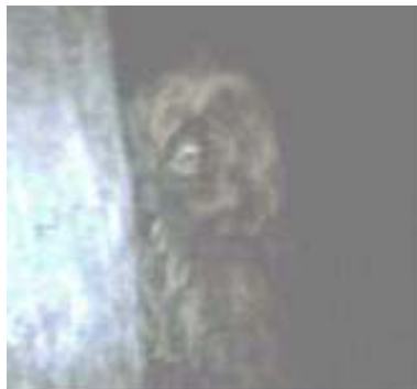
Hi res picture from the film.

We began to develop the witness and asked him some common questions. Truthfully the guy seemed like a legitimate witness had we not been marred with the video. However some things have emerged that I believe