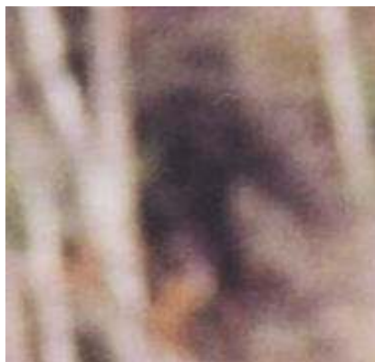
Composite enlargement of photo & negative

There also have been some theories that the unknown figure is in reality a tree stump.