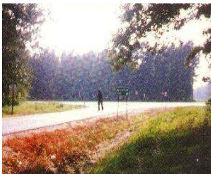
Hitch Hiking ???