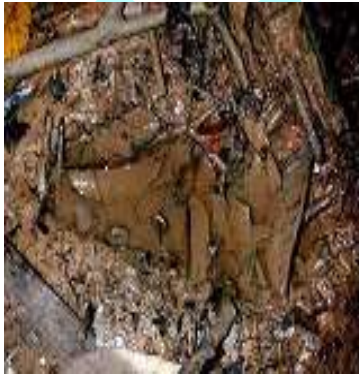
Print on the jungle floor of Malaysia.

Government conspiracies are abound and the Interior Ministry, who was very vocal about saying they were worried foreign groups were going to come up