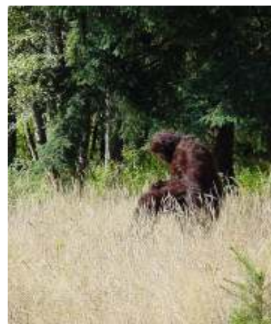
Deep in thought