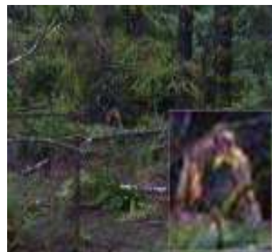
Bad Hair Day???