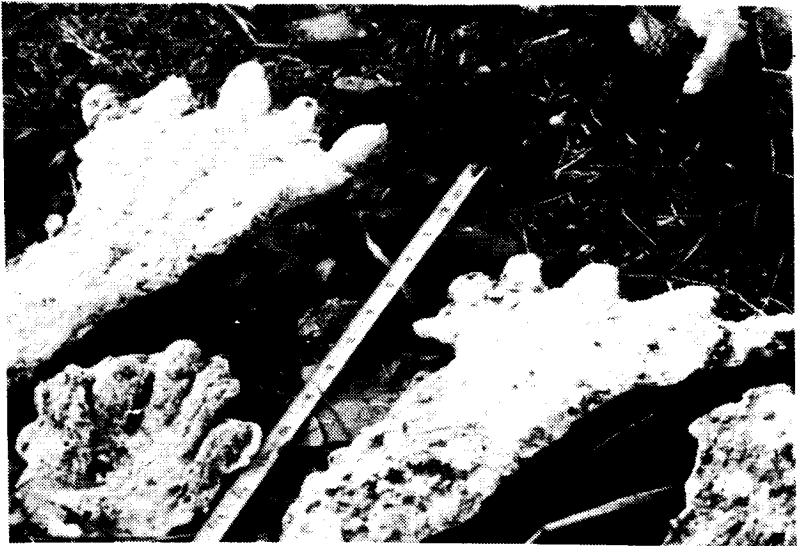
Casts of Rodney Peoples 10/18/80

The toe configurations are not in proportion with the rest of the foot.