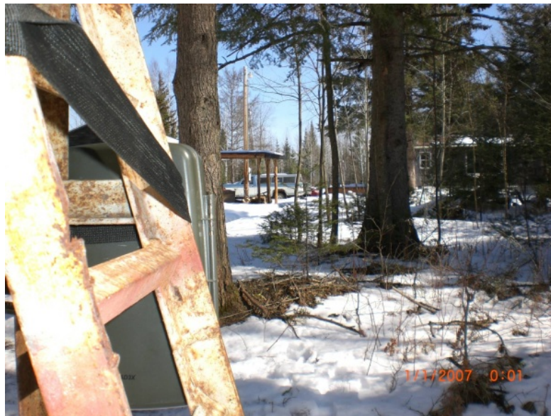
Looking toward the spot where Big Phil stood, the image above shows where the trail-cam was mounted. It is strapped to the side of a metal vehicle ramp/rack.

Time/date stamp was still not set properly when this image was taken -- February 15, 2006.